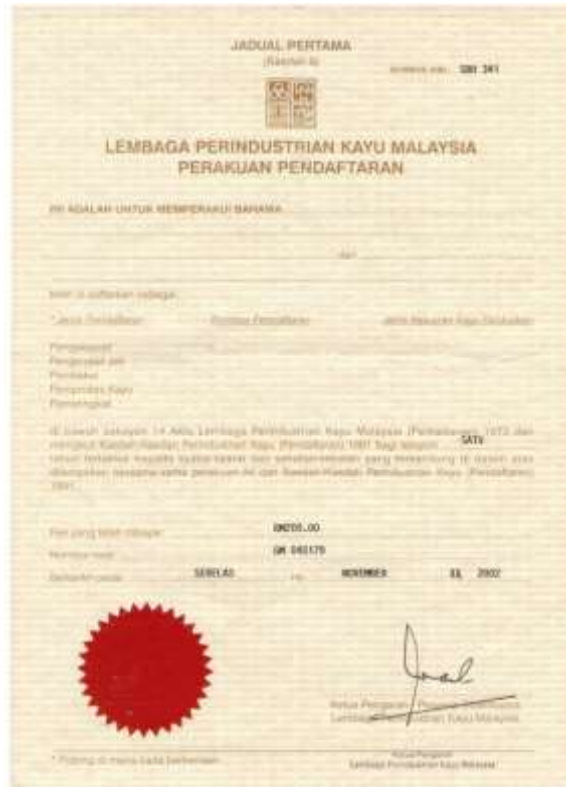
Figure 4: Registration with Malaysian Timber Industry Board