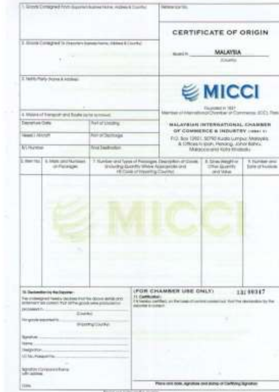
Figure 5: Certificate of Origin