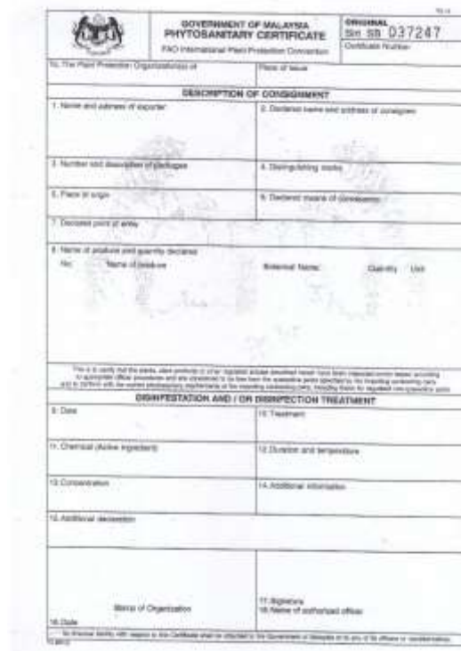
Figure 6: Phytosanitary Certificate